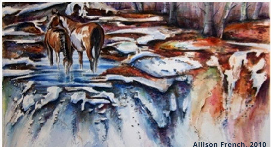
Allison French, 2010

The opportunity to show in the presence of some of the best artists in the industry